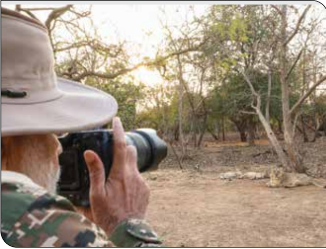
PM Shri Narendra Modi visits Gir National Park on the occasion of World Wildlife Day, in Gujarat on March 03, 2025