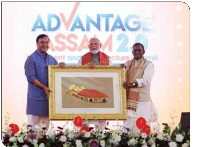
PM Shri Narendra Modi at the inauguration of Advantage Assam 2.0 Investment & Infrastructure Summit 2025 in Guwahati, Assam on February 25, 2025