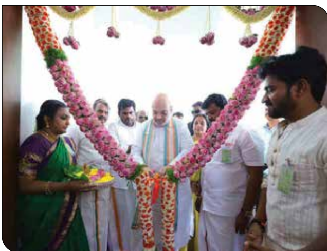
Union Home & Cooperation Minister Shri Amit Shah inaugurating the District BJP offices of Coimbatore, Thiruvannamalai & Ramanathapuram in Tamil Nadu on 26 February 2025