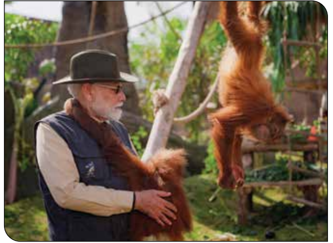
PM Shri Narendra Modi inaugurates and visits the wildlife rescue, rehabilitation and conservation centre at Vantara in Gujarat on March 04, 2025