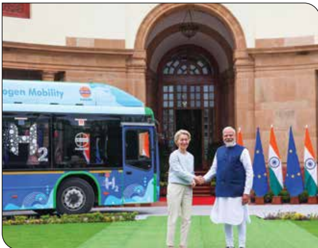
PM Shri Narendra Modi meets the President of the European Commission, Ms. Ursula Von Der Leyen at Hyderabad House in New Delhi on February 28, 2025