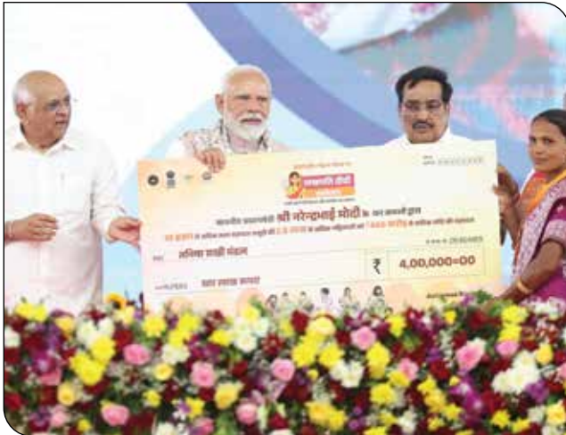
PM Shri Narendra Modi attends the public function to marking the International Women's Day held at Navsari, in Gujarat on March 08, 2025