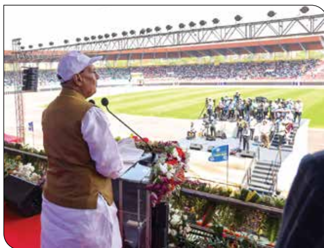
Defence Minister Shri Rajnath Singh addressing the National Science Day celebrations in Hyderabad, Telangana on 28 February 2025