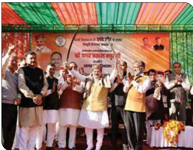
Himachal Pradesh BJP welcoming BJP National President & Union Minister Shri JP Nadda to the "Abhinandan Samaroh" in Bilaspur on 06 March 2025