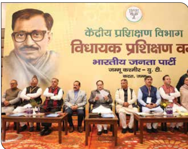
BJP National President & Union Minister Shri JP Nadda at the MLA's training camp of Jammu & Kashmir in Katra on 01 March 2025