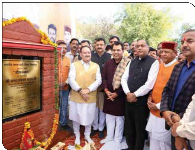
BJP National President & Union Minister Shri JP Nadda laying the foundation stone of BJP Distt. Office "Deepkamal" at Raghunathpur, Bilaspur, Himachal Pradesh on 06 March 2025