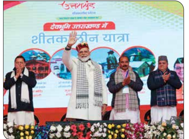
PM Shri Narendra Modi participates in the Public Function to marking the 'Winter Tourism Program' at Harsil in Uttarakhand on March 06, 2025