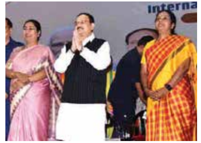
'From Jana Sangh to BJP, we have consistently given priority to women's empowerment'