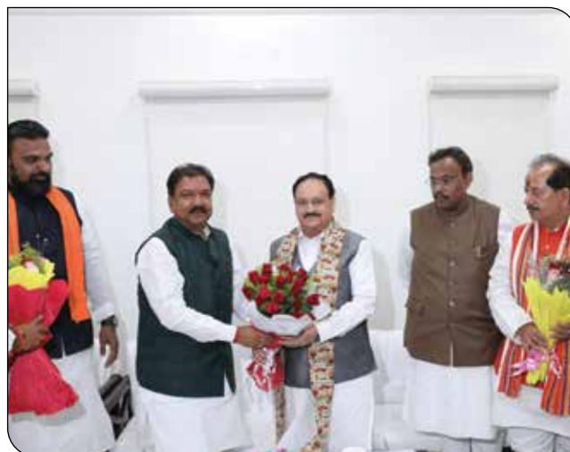
BJP National President & Union Minister Shri JP Nadda meeting the BJP Core Committee and Council of Ministers in Patna, Bihar on 25 February 2025