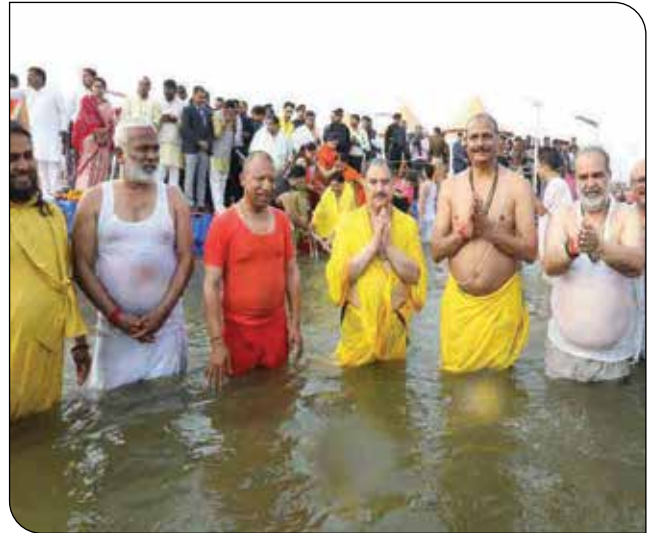
BJP National President Shri JP Nadda along with the CM of UP Yogi Adityanath taking Holy Dip in Sangam & offered prayers in Prayagraj, U.P on 22 February, 2025