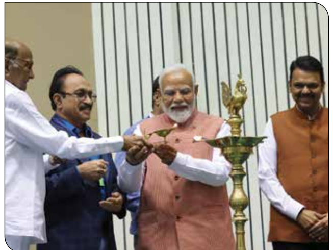
PM Shri Narendra Modi lighting the lamp at the inauguration of 98th Akhil Bharatiya Marathi Sahitya Sammelan in New Delhi on February 21, 2025