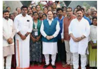
“Kashi Tamil Sangamam showcases India's unity amidst immense cultural diversity”