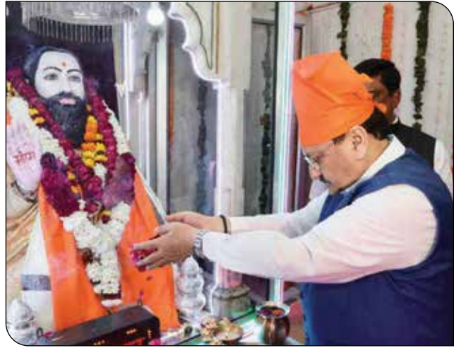
BJP National President and Union Minister Shri JP Nadda offering prayers at Shri Guru Ravidas Vishram Dham Mandir Trust on the occasion of "Guru Ravidas Jayanti" at Deshbandhu Gupta Road, New Delhi on 12 February, 2025