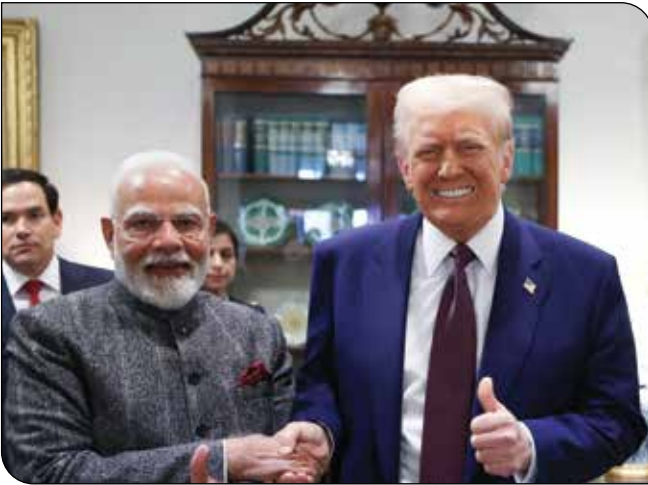
PM Shri Narendra Modi meets the President of USA, Mr. Donald Trump at White House in Washington DC, USA on February 13, 2025