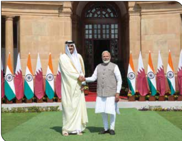
PM Shri Narendra Modi meets the Amir of the State of Qatar, Sheikh Tamim Bin Hamad AL Thani at Hyderabad House in New Delhi on February 18, 2025