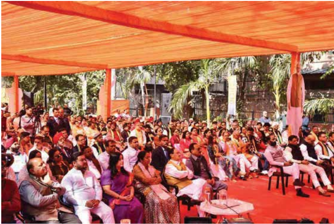
BJP National President and Union Minister Shri JP Nadda alongwith senior leaders of Delhi BJP listening Prime Minister Shri Narendra Modi ji's "Mann Ki Baat" with party Karyakartas in Narayana Vihar, Delhi on 23 February 2025