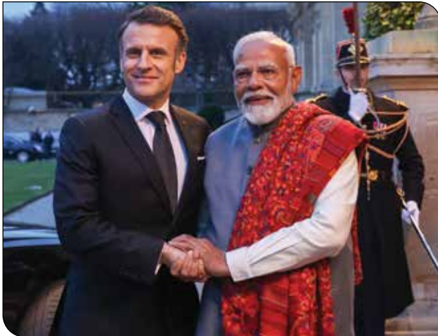
President Macron welcomes PM Shri Narendra Modi to India-France CEO Forum on February 11, 2025