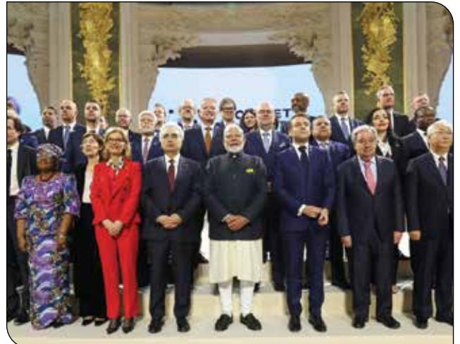
Group photograph of the global leaders participated at the AI Action Summit in Paris on February 11, 2025