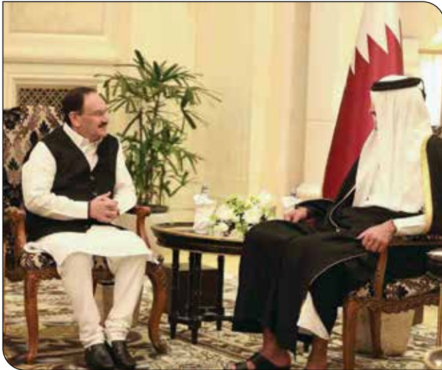
BJP National President and Union Minister Shri Jagat Prakash Nadda meets His Highness Sheikh Tamim Bin Hamad Al Thani, Amir of the State of Qatar in New Delhi on 18 February, 2025