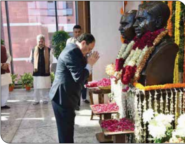
BJP National President and Union Minister Shri JP Nadda paying floral tributes to Pt. Deendayal Upadhyay ji on his Punyatithi at BJP HQ, New Delhi on 11 February, 2025