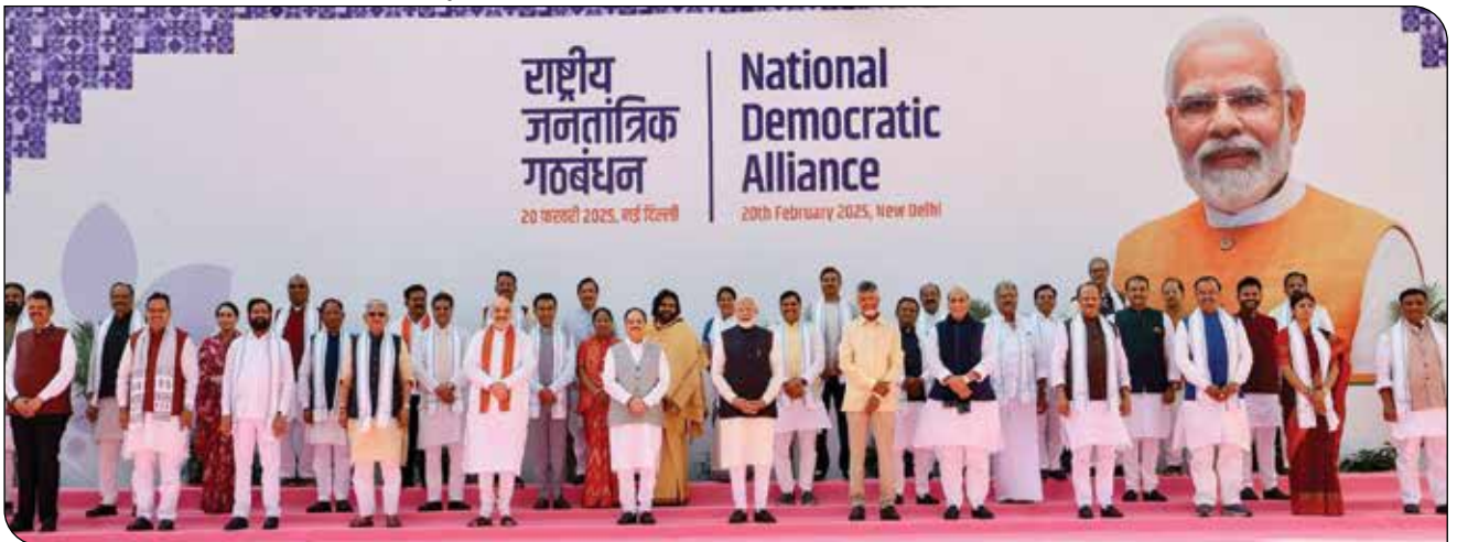
PM Shri Narendra Modi, BJP National President and Union Minister Shri JP Nadda, Defence Minister Shri Rajnath Singh, Union Home & Cooperation Minister Shri Amit Shah and other senior NDA leaders attending the NDA meeting held in New Delhi on 20 February, 2025