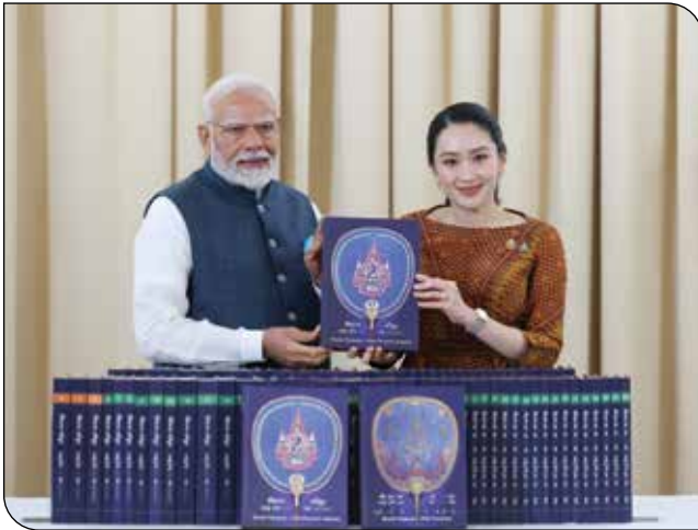
PM Shri Narendra Modi presented with the Holy Scriptures: "World Ti-pitaka: Sajjhaya Phonetic Edition" by the Prime Minister of Thailand, Ms Paetongtarn Shinawatra at Bangkok in Thailand on April 03, 2025