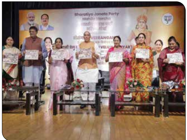
Defence Minister Shri Rajnath Singh and other senior leaders unveiling a book, documenting the contributions of 75 female freedom fighters who sacrificed their lives for India's independence in New Delhi, on 29 March 2025