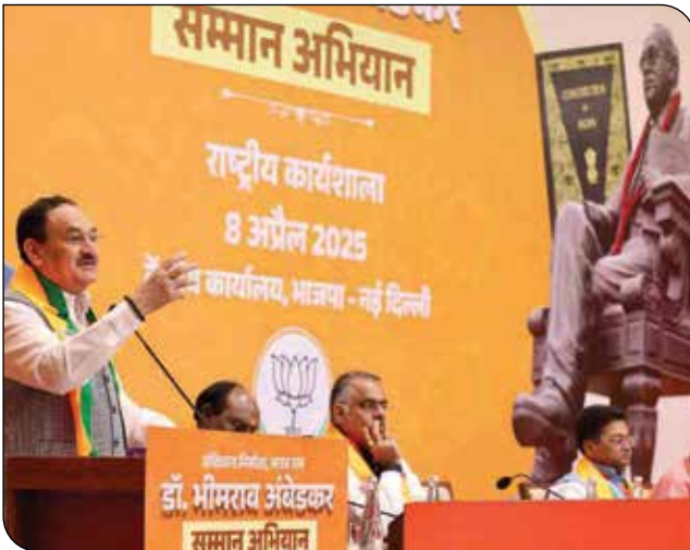
BJP National President Shri JP Nadda addressing the inauguration session of National Workshop on Bharat Ratna Dr. B.R. Ambedkar "Samman Abhiyan" at BJP HQ, New Delhi on 08 April 2025