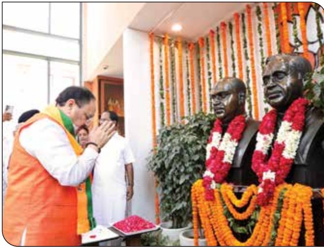
BJP National President and Union Minister Shri JP Nadda paying floral tributes to Dr. Syama Prasad Mookerjee & Pt. Deendayal Upadhyaya on the occasion of 'BJP's Sthapna Diwas' at BJP HQ, New Delhi on 06 April 2025