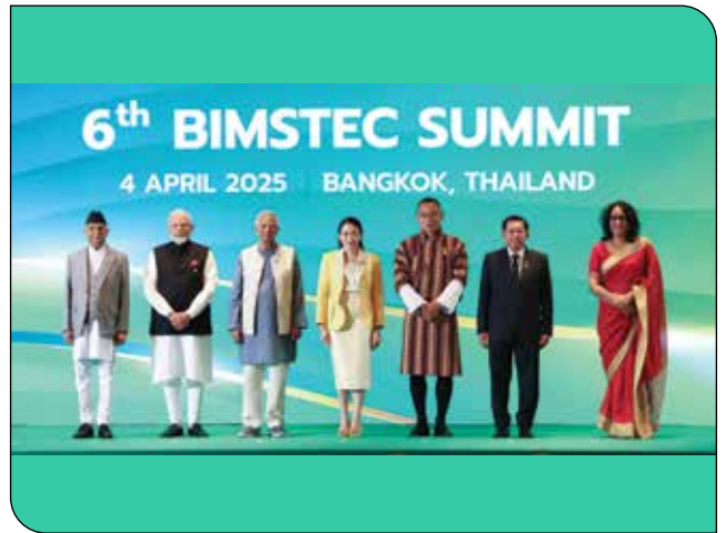
PM Shri Narendra Modi attends the 6th BIMSTEC Summit at Bangkok in Thailand on April 04, 2025