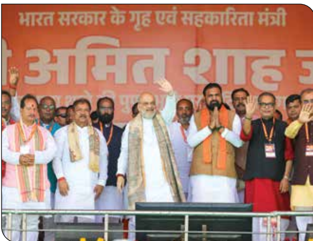
Union Home and Cooperation Minister Shri Amit Shah receiving the greetings of people at a massive public rally in Gopalganj in Bihar on 30 March 2025