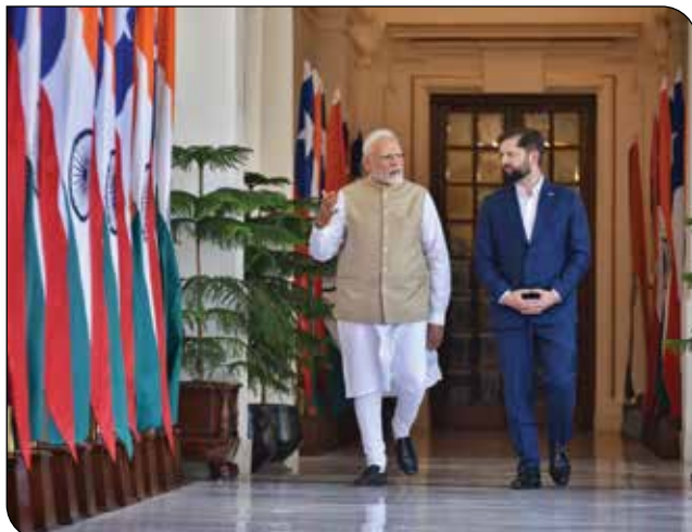
PM Shri Narendra Modi meets the President of the Republic of Chile, Mr. Gabriel Boric Font at Hyderabad House in New Delhi on April 01, 2025