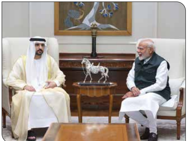
PM Shri Narendra Modi meets Crown Prince of Dubai, Sheikh Hamdan bin Mohammed bin Rashid Al Maktoum, in New Delhi on April 08, 2025