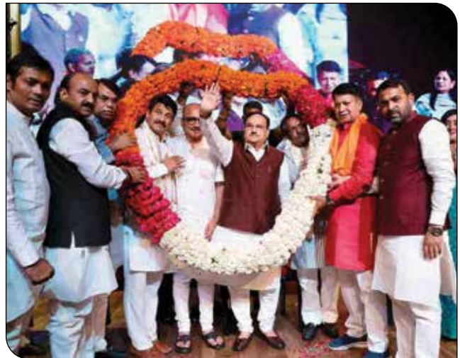
BJP National President & Union Minister Shri JP Nadda receiving the greetings of people at "Ek Bharat - Shreshtha Bharat Sheh Milan" Programme on the occasion of Bihar Diwas 2025 at Dr. Ambedkar Int'l Centre, New Delhi on 29 March 2025