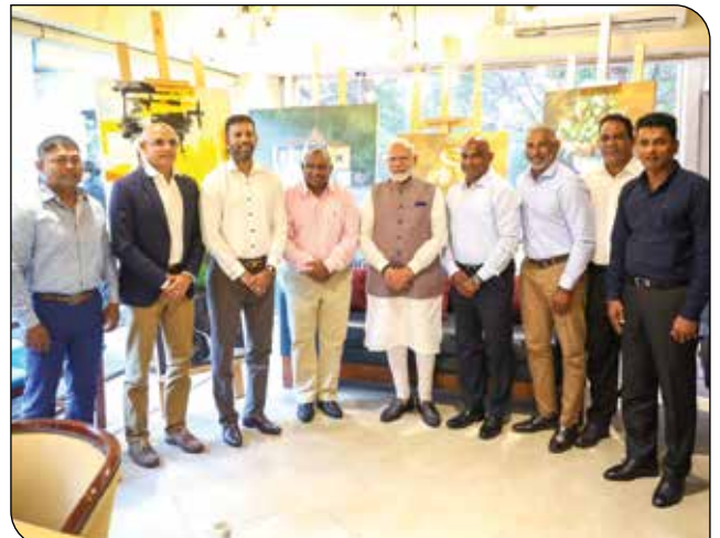
PM Shri Narendra Modi interacts with the Sri Lankan cricketers at Colombo, in Sri Lanka on April 05, 2025