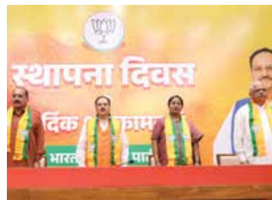
'BJP is a party driven by ideology'