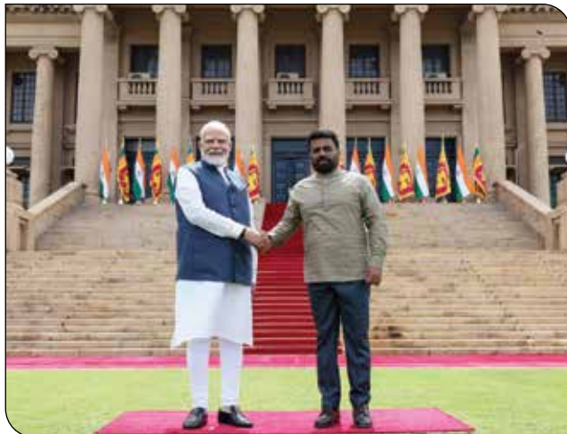
PM Shri Narendra Modi meets the President of the Democratic Socialist Republic of Sri Lanka, Mr. Anura Kumara Dissanayake at Colombo, Sri Lanka on April 05, 2025