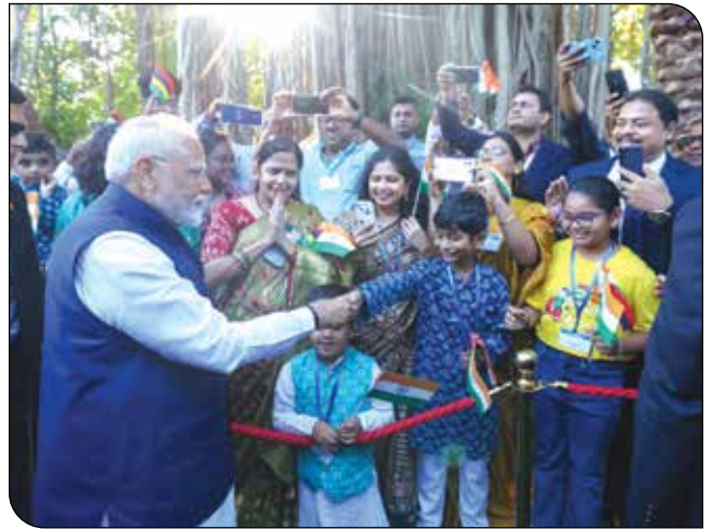
PM Shri Narendra Modi receives warm welcome by Indian community in Mauritius on March 11, 2025