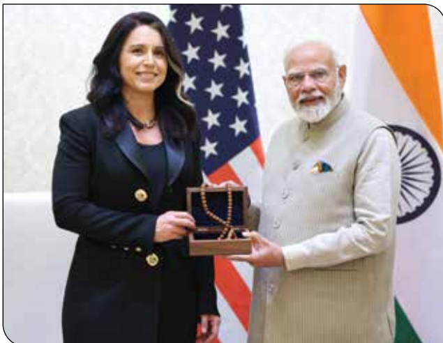
PM Shri Narendra Modi meets the Director of National Intelligence of the United States, Ms Tulsi Gabbard in New Delhi on March 17, 2025