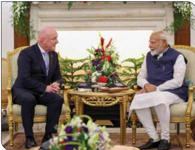
PM Shri Narendra Modi meets the Prime Minister of New Zealand, Mr. Christopher Luxon at Hyderabad House in New Delhi on March 17, 2025