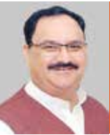
JAGAT PRAKASH NADDA

The recently concluded 100-day Intensified TB Mukht Bharat Abhiyaan has not only demonstrated the power of innovation but has also shown that mobilising communities is just as crucial as transforming the programmatic approach. The campaign was launched on December 7, 2024, with the objectives of accelerating TB case detection, reducing mortality and preventing new cases