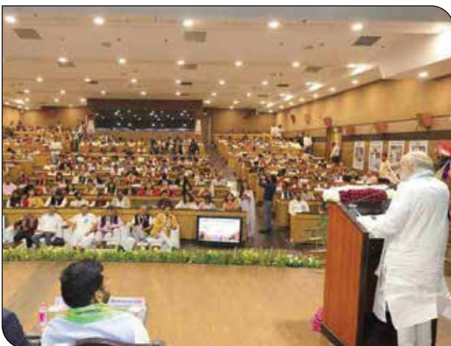
Union Home & Cooperation Minister Shri Amit Shah addressing at the North-East Students' & Youth Parliament in New Delhi on 11 March 2025