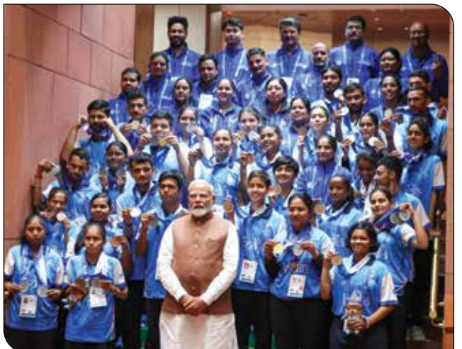
PM Shri Narendra Modi meets the Special Olympics World Winter Games held in Turin, Italy contingent which brings home 33 medals in New Delhi on 18 March 2025