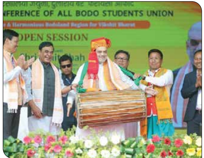
Union Home and Cooperation Minister Shri Amit Shah at the 57th annual conference of All Bodo Students' Union in Kokrajhar, Assam on 16 March 2025