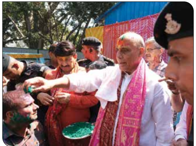
Defence Minister Shri Rajnath Singh celebrating the festival of colours Holi with BJP karyakartas and others in New Delhi on 14 March 2025