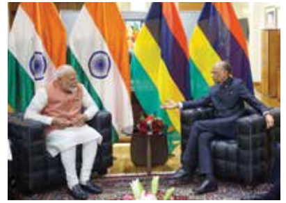
PM Modi's State Visit to Mauritius: Strengthens Bilateral Ties and Regional Cooperation