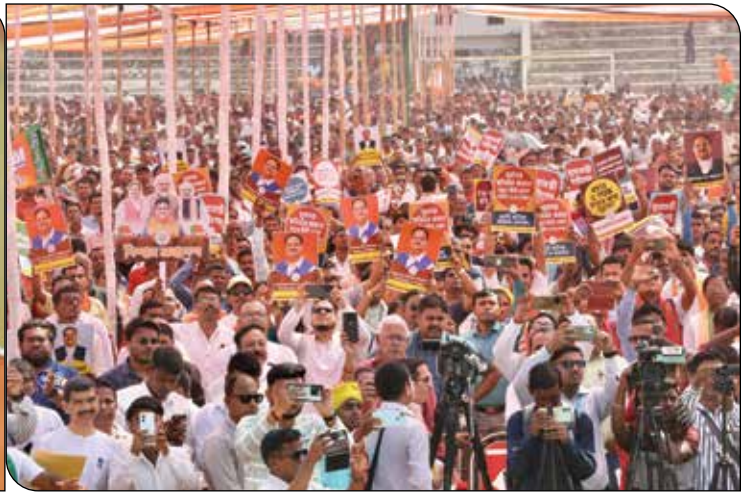
BJP National President and Union Minister Shri JP Nadda addressing at a massive public rally in Agartala (Tripura) on 09 March 2025, on the completion of two years of BJP government in the State