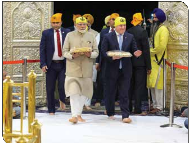
PM Shri Narendra Modi and the Prime Minister of New Zealand, Mr. Christopher Luxon visit Gurdwara Rakab Ganj Sahib in New Delhi on March 17, 2025