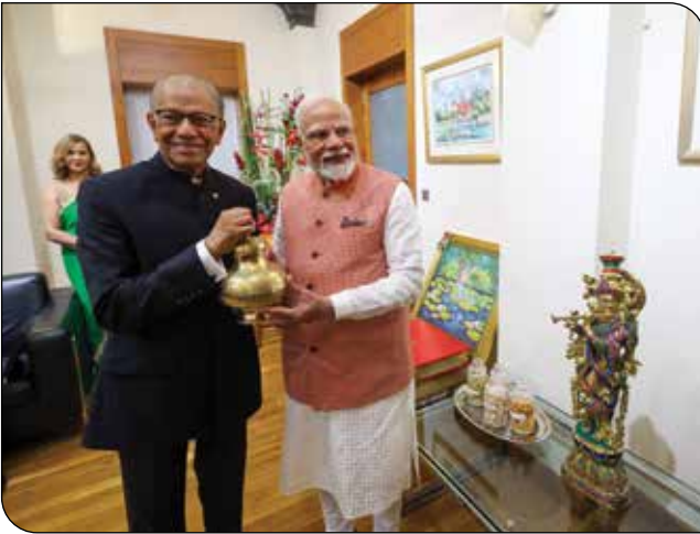
PM Shri Narendra Modi meets the Prime Minister of Mauritius, Dr Navinchandra Ramgoolam at Port Louis in Mauritius on March 11, 2025