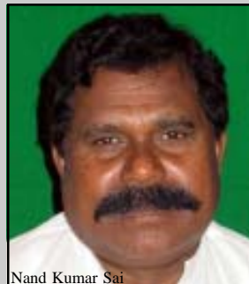
Nand Kumar Sai